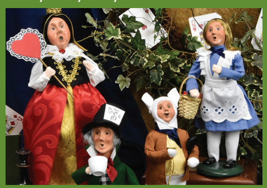
Join Us Saturday, November 16th & Sunday, November 17th Byers' Choice Annual Event Scavenger Hunt, Guessing Game, Prizes, and Specials

Byers' Choice has created two new fun and exciting fall collections, Frankenstein and Alice in Wonderland. Frankenstein and the Bride of Frankenstein make a thrilling duet for a year-round display. Alice's iconic blue dress and basket of magical mushrooms emulate the curiosity and magic that she experiences on her journey through Wonderland. These new pieces can easily be incorporated into your current holiday décor. Come create and replicate your own holiday family this year.